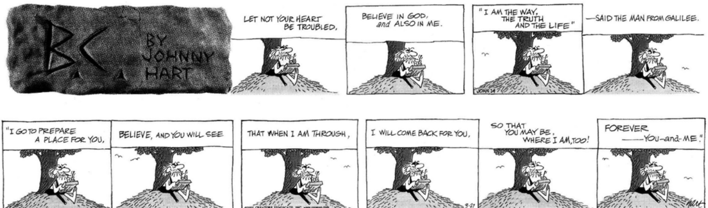
from The Joyful Noiseletter

*Also referred to as BCE (Before Common Era) and CE (Common Era).